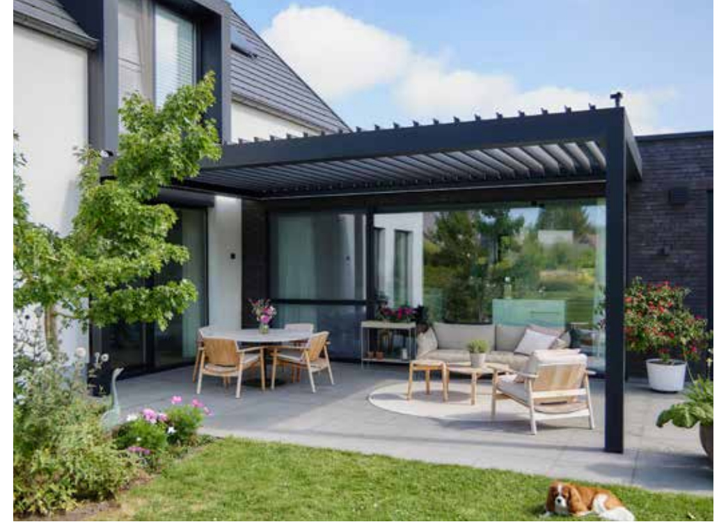
Pergolas with louvres

Meet the Pergola ZIP Cube, a stylish patio cover with roll-up fabric. This pergola with a horizontal roof is attached to the house, just like an awning. Awarded with a Red Dot: Best of the Best Design Award.