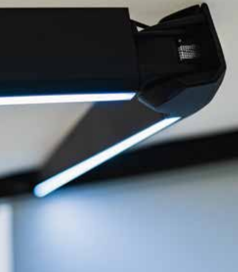
4-way cable arm