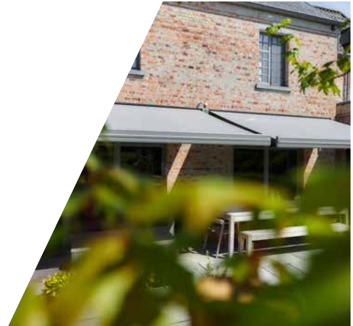
Dyneema Powerband - arm

...more and more people are opting for wide awnings with a larger drop? The average awning today is wider than 5 m and has a drop of more than 3.5 m. That's large!