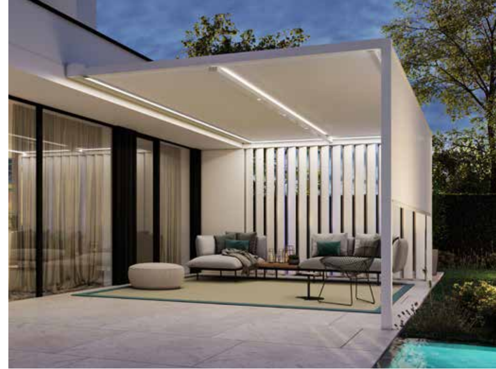
Pergolas with cloth

Lose track of time and enjoy your conservatory during those wonderful summer days. Winsol veranda blinds keep your veranda cool in a sustainable and energy-efficient way. Bye bye overheating!